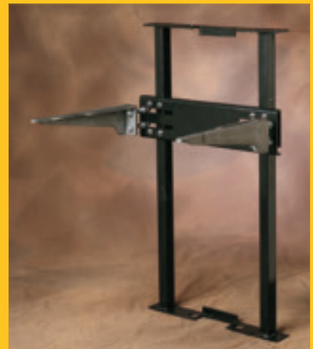
Lavatory support with Exposed Arms (Figure #0760)