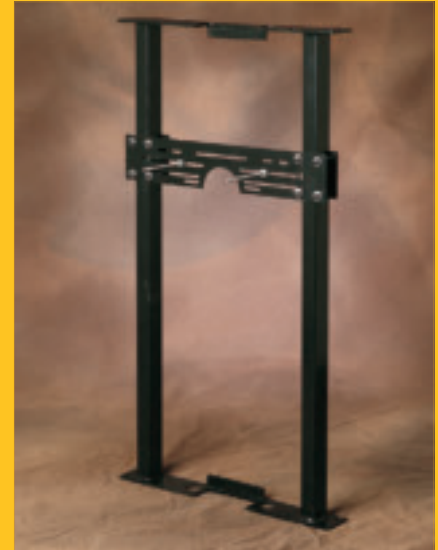
Urinal support for Off-the-Floor urinals with hanger plate for blowout and washout urinals (Figure #0616) and lavatory support with concealed hangers (Figure #0801)