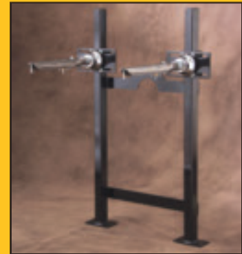
Lavatory Support with Concealed Arms (Figure # 0710)

Uncommon cross support design to allow room for waste piping.