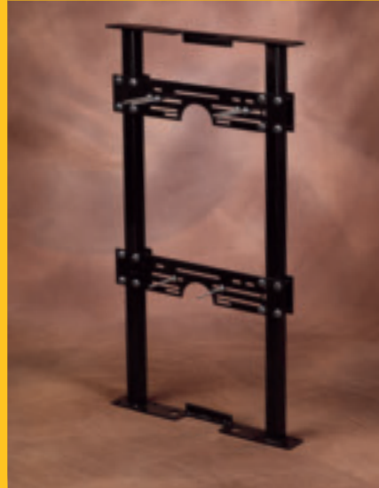
Urinal support for Off-the-Floor urinals with supporting and bearing studs (Figure #0617) and electric water cooler support (Figure #0831)